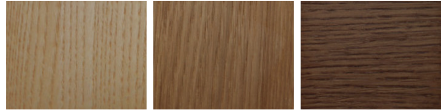
Beech - Ash

Finishes shown below, many special stains and lacquers on request: